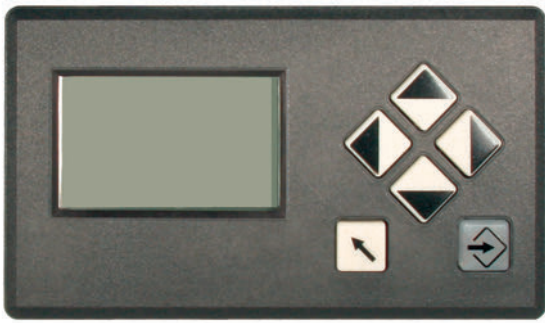
Fig. 1 Figure UI400