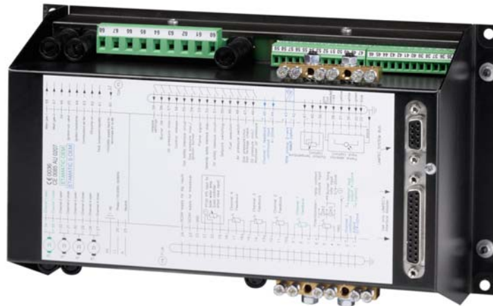
Fig. 1 ETAMATIC OEM / ETAMATIC S OEM