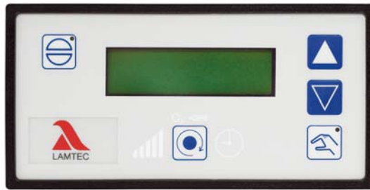
Fig. 3 Customer interface ETAMATIC OEM / ETAMATIC S OEM