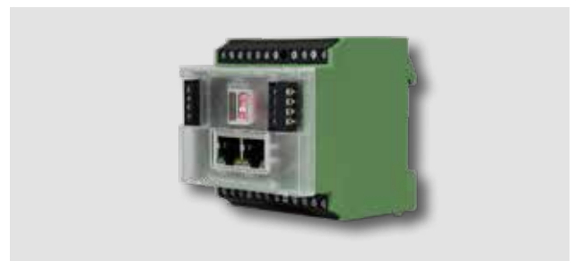
EBM112 ProfiNet module.