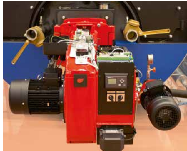
BT320 mounted on a burner.

The BurnerTronic BT300 was designed to be mounted directly on the burner. Short wiring routes and pre-wired or 'plug and socket' motors significantly reduce installation time and reduce potential wiring errors. The Burner-