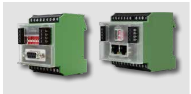
PBM100 - PROFIBUS module.