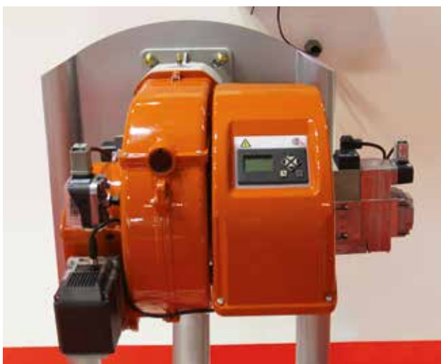
BT320 mounted on a burner.

The fuel/air ratio curves and operating parameters are set and adjusted using either the UI300 HMI or LAMTEC's LSB Remote Software. To reduce the emission of harmful NO x , a composite duct can be configured as an exhaust gas recirculation. The fuel/air ratio can be optimised to compensate for combustion variables by implementing oxygen trim or CO control to ensure the burner operates to its maximum possible efficiency.