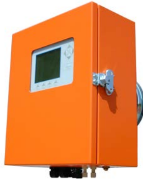
Fig. 1 LT10 ...